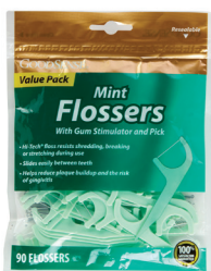
Interdental Flossers Count: 90