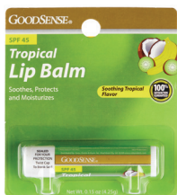
Medicated Lip Balm, 0.15 oz. Count: 1