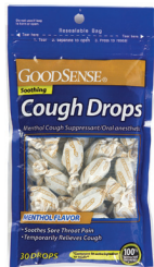
Cough Drops, Menthol Count: 30