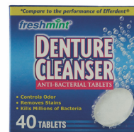
Denture Cleaning Tablets Count: 40