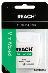
Dental Floss, Reach®, Mint Waxed Count: 1