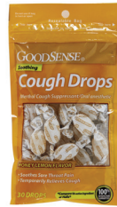
Cough Drops, Honey Lemon Count: 30