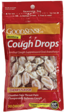
Cough Drops, Cherry Count: 30