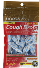
Cough Drops, Sugar-Free, Black Cherry Count: 25