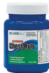
Vapor Rub, 3.5 oz. Count: 1